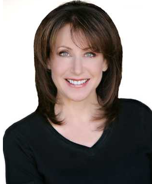
Garage Sale Gal